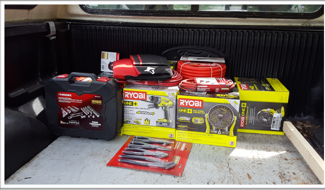
Tools and Battery Fans