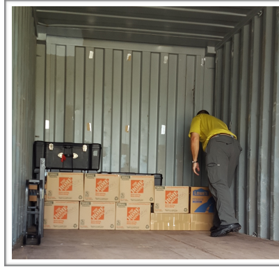
Boxes of books & etc.