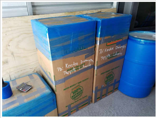
Iowa shipment ready to go!