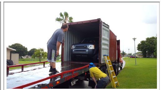
Had to get a flatbed to load the Land Rover into the container... as you can see, very tight fit!